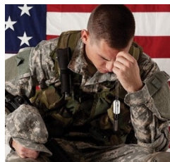
Our Veterans, PTSD